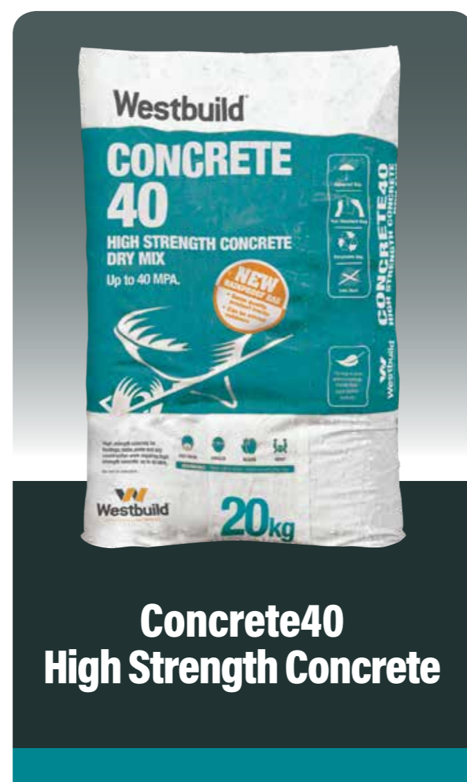
Concrete40 High Strength Concrete