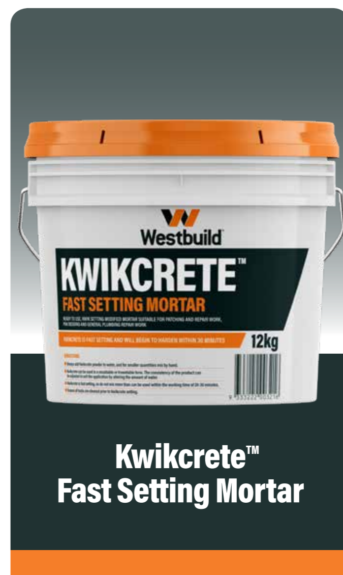
Kwikcrete™ Fast Setting Mortar