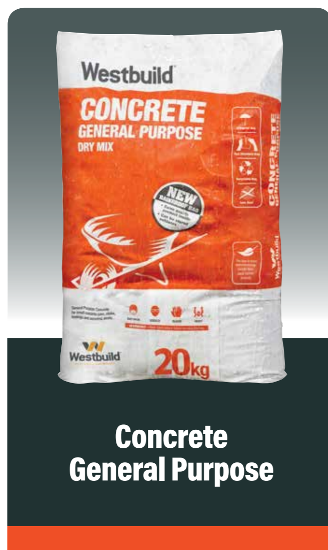
Concrete General Purpose