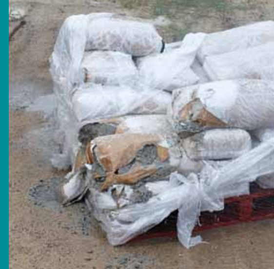
Old paper bags

Because the content of Dry As A Bone bags is packed tightly and evenly, the bags are easier to stack in a neat and orderly way. Bags can be safely stacked to at least four pallets high with no risk of instability or damage.